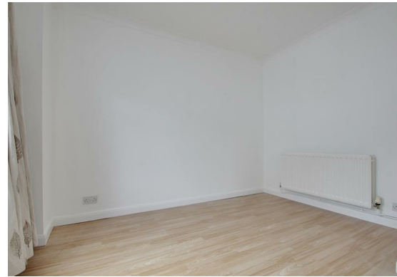
Bedroom Two 8'4 x 7'10 (2.54m x 2.39m) Bathroom West Facing Courtyard Garden